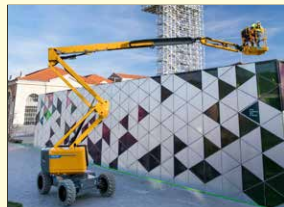
20791 - Haul. HA20LE Pro 20,7m - 4x4 - Battery - 2022

... since 1976 Rothlehner working platforms