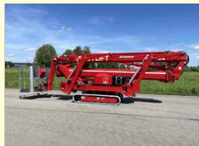
20747 - EasyLift RA 31 31m - 230V & Diesel - year 21