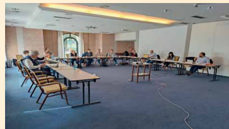
Product training and meeting at EASYLIFT

As a work platform dealer with more than 40 years of experience, we know how important the cooperation with our manufacturing partners is. Mutual visits therefore take place regularly. This was the case at the beginning of May when a delegation of the Rothlehner team visited the work platform manufacturers GSR (truck-mounted work platforms) and EASYLIFT (track-mounted crawler chassis work platforms).