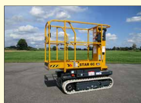
21466 - Haulotte Star 6 C 6m - Battery - year 2022