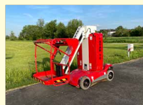
21931 - Haulotte Star10 10m - Battery - year 2012