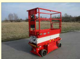
21799 - JLG 6RS 7,79m - Battery - year 2016