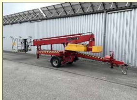
22133 - DENKA DK3MK24 21m - Battery - year 1996