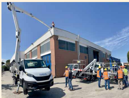
Current truck-mounted work platforms are put through their paces on the premises of GSR in Rimini.