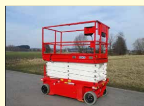
21796 - JLG 10RS 11,75m - Battery - year 2016