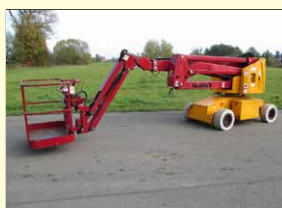
18169 - Haulotte HA15IP 15m - Battery - year 2004