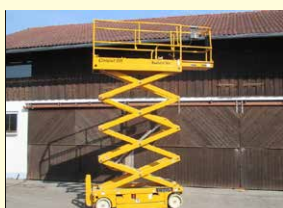
18809 - Haulotte Compact10N 10m - Battery - year 2007