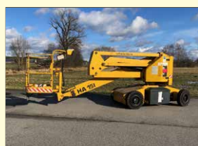
18402 - Haulotte HA 15 I 15m - Battery - year 1999