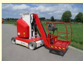
21934 - Toucan 12E Plus 12,6m - Battery - year 2014