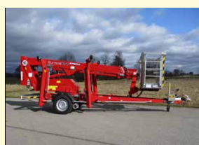
20964 - Eurolift TM13T 13m - 230V & Petrol - 2021