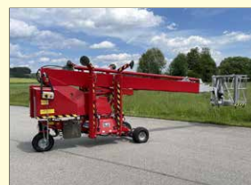
15263 - DENKA DL22N 22m - Battery - year 2019