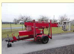
950 - DENKA DK7MK21 16m - Battery - year 1994