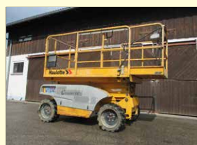
20420 - Compact 10DX 10,3m - 4x4 Diesel - year 2008