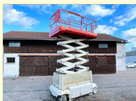
10614 - PB S151-16 E 15m - Battery - year 2014