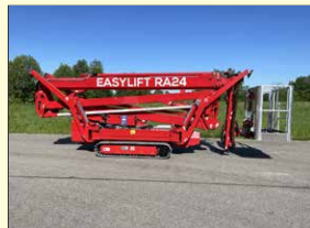
20651 - EasyLift RA24 23,5m - 230V & Diesel - 2022