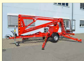
21207 - Eurolift TM13G 13m - 230V drive - year 2022