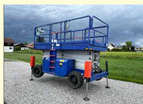
14893 - Haulotte H18SX 18,00m - Diesel - year 2007