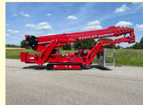
21192 - EasyLift R420 41,4m - Batt. & Diesel - 2022