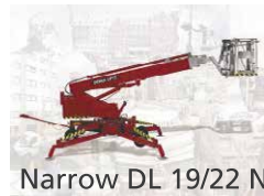
Narrow DL 19/22 N