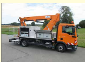
11488 - GSR E180TJ 18m - 163.000km - year 2015