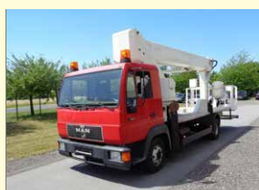
21330 - Wumag WT300 30m - 184.000km - year 1998