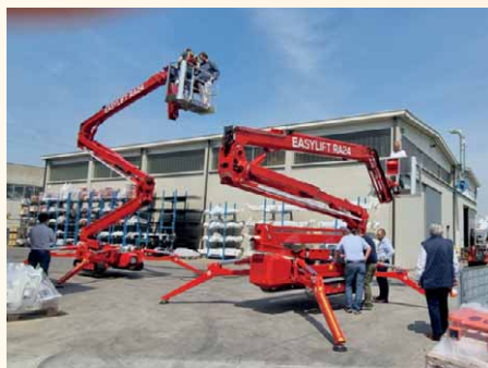
The Rothlehner team examines the EASYLIFT model RA24

Many thanks to the teams from GSR and EASYLIFT for their hospitality. We will be able to master the challenges of the future well in this way.