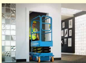
20856 - Instant Lift 5m - Push Around - 2019