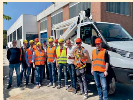
Employees of GSR and the delegation from Rothlehner