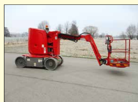
21560 - Haulotte HA12CJ 12m - Battery - year 2010