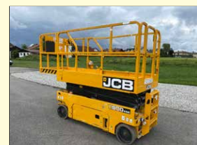
21363 - JCB S2046E 8,30m - Battery - year 2019