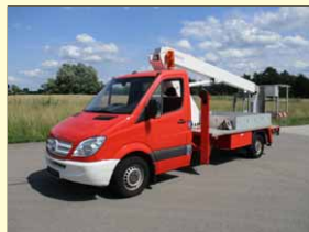
23646 - ESDA TL1650 16m - Diesel - 78.000km - 2011