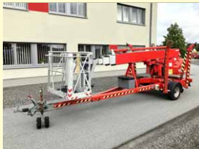
5450 - DENKA DL18 18m - Battery - 2007