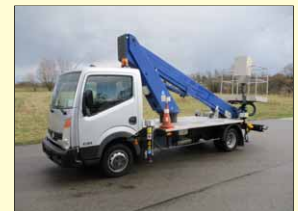
9025 - GSR E179T 17m - Diesel - 30t km - 2012