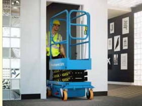
23220 - Instant Lift ES30 5,00m - Push-Around - 2022