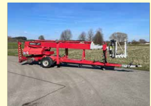
16449 - DENKA DL30 30m - Battery - 2009

For an offer please note machine-number on backside and send it back to us.