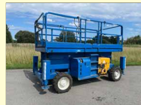
23766 - Haulotte H15SX 15m - Diesel - year 2008