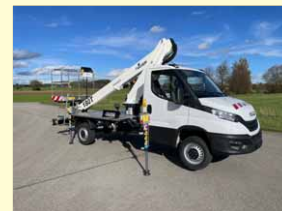
22841 - GSR B180T 18m - Iveco Daily - 2023