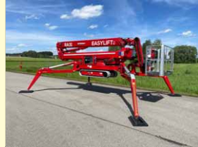
20747 - EasyLift RA 31 30,2m - 230V & Diesel- 2022