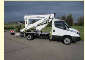
22636 - GSR B220PXE 21,5m - Diesel - 2023