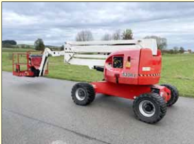
24783 - JLG 510AJ 17,8m - 4x4 Diesel - 2014