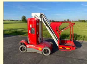
24759 - Haulotte Star10 10m - Battery - 2013