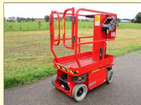
22589 - JLG 1230ES 5,66m - Battery - Bj. 2012