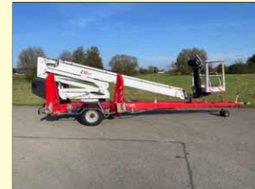
24636 - DinoLift 210XT 21m - 230V & Benzin - 2007