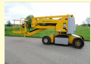
23658 - Haulotte HA15 15m - Battery - 2000