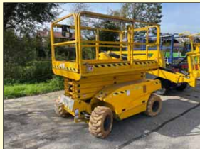
18953 - Compact 12 RTE 12m - Batterie - 2007