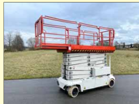
5051 - PB S171-12 E 17m - Battery - 2006