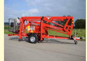
22017 - Europelift TM16GT 16m - 230V & Benzin - 2023