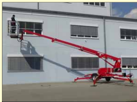
22630 - Europelift TM13T 13m - 230V & Benzin - 2023