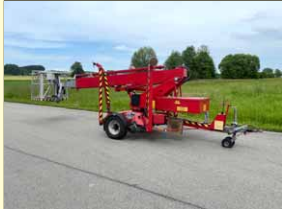
5176 - DENKA DK18 18m - Battery - year 2007