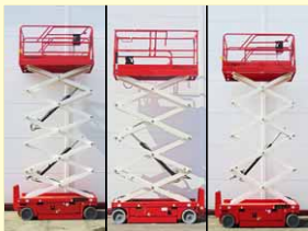
Haulotte Compact-Scheren C8-C10-C10N-C12 • 2007-13