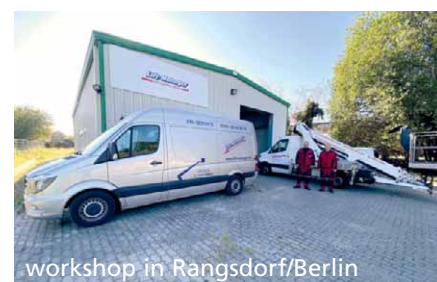
workshop in Rangsdorf/Berlin

Recently, the teams from our subsidiaries in Datteln and Breitenfelde were increased from four to five technicians, and in Berlin-Rangsdorf, a second service technician has been employed. Here a workshop has been rented to carry out some repairs under roof.