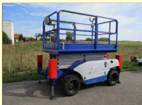
24387 - Haul. Compact 12DX 12m - Diesel 4x4 - 2007