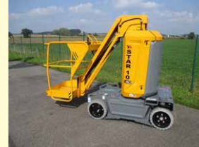
23750 - Haulotte Star10 10m - Battery - year 2023