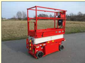
21799 - JLG 6RS 7,79m - Battery - 2017