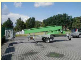
5362 - DENKA DK25 25m - Battery - year 2007