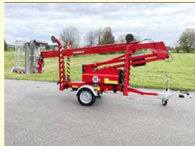
14834 - DENKA Junior 12 12m - 230V Antrieb - 2018